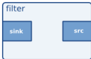
Figure 5-2. Visualisation of a filter element

Figure 5-2 shows how we will visualise a filter-like element. This specific element has one source and one sink element. Sink pads, receiving input data, are depicted at the left of the element; source pads are still on the right.